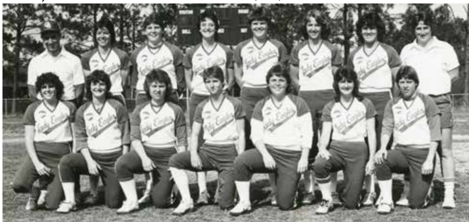
1984 Georgia Southern Slow Pitch Softball Team