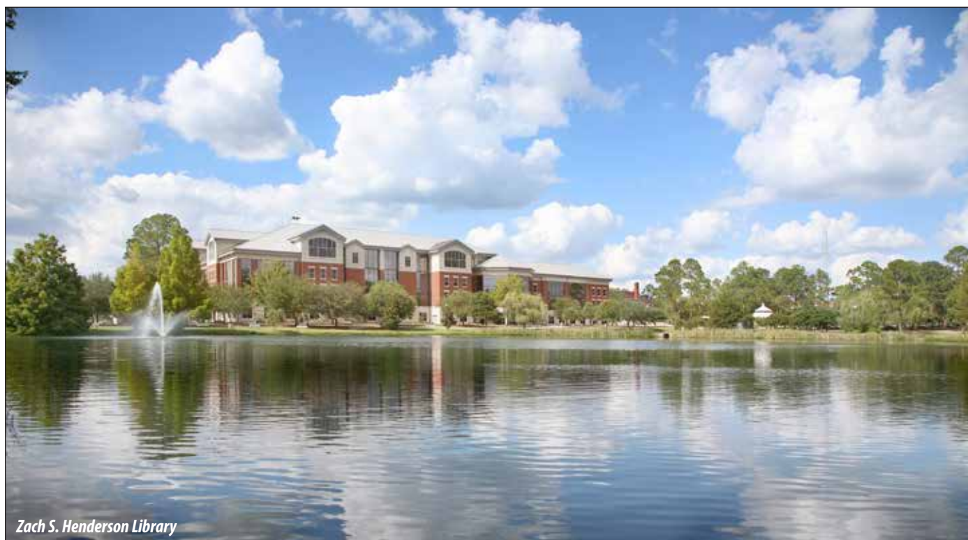
Zach S. Henderson Library