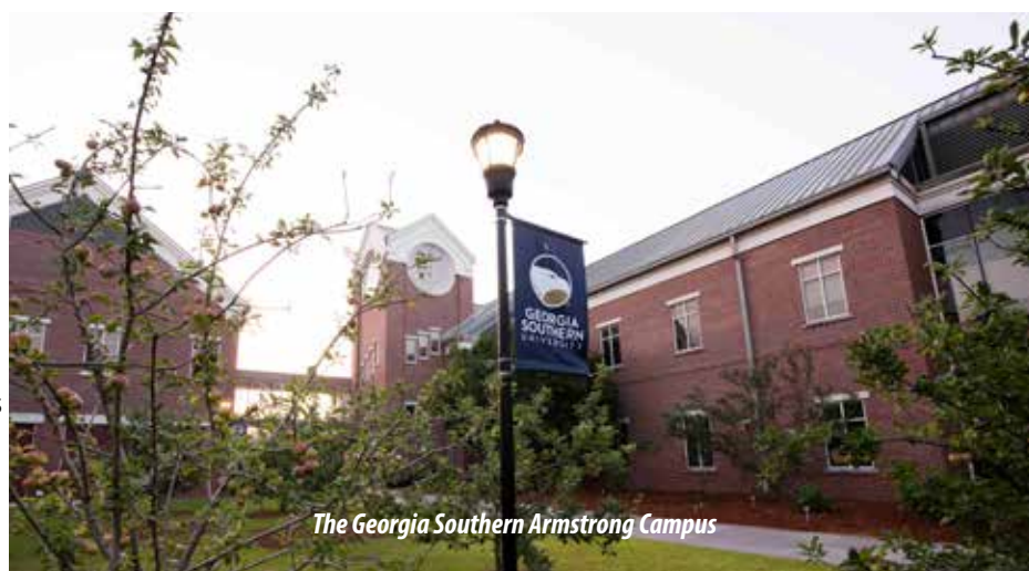
The Georgia Southern Armstrong Campus