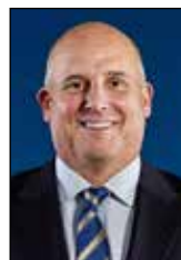
CLAY HELTON Football