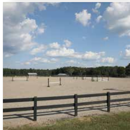
UNIVERSITY OF GEORGIA JUMPING SEAT ARENA