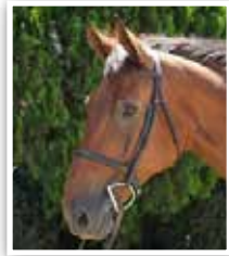
SALLY Jumping Seat Donor: The Screnci Family