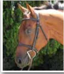
BENNY Jumping Seat Donor: The Becker Family