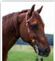
WOODY Reining Donor: UGAAA