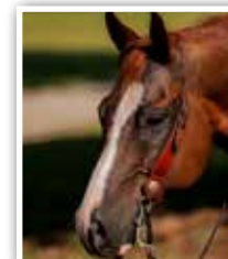
TRAVIS Reining Donor: The Schramm Family