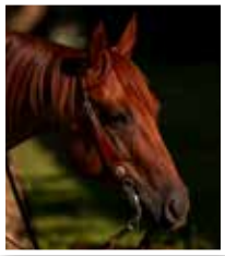
MR. BOAZ Reining Donor: The Roper Family