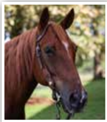
COWBOY Western Owned by UGAAA