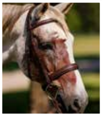
SUNNY Jumping Seat Donor: Courtney Neely