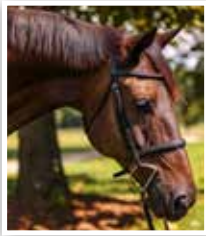
SAL Jumping Seat Donor: Tristan Harstan