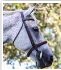
CLU Jumping Seat Donor: Amy Sievert