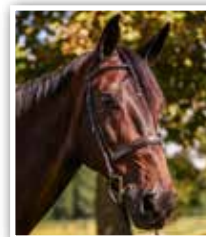
MISO Jumping Seat Donor: Devon MacNeil