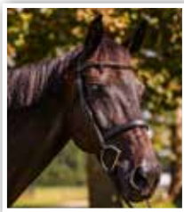
EMILIA Jumping Seat Donor: Cori Sawyer-Lyons