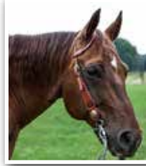
SLASH Reining Donor: The Blumer Family