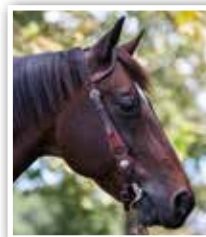
HENRY Western Donor: Jamie Lapoe