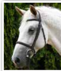
CONSTANTINE Jumping Seat Donor: Patricia Scopellite