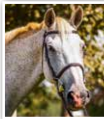
GRANITE Jumping Seat Donor: MDL LLC, Illinois