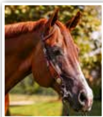
JERRY Horsemanship Donor: Superior Care Management, LLC