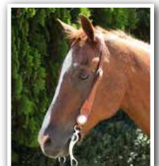
TY Reining Donor: UGAAA