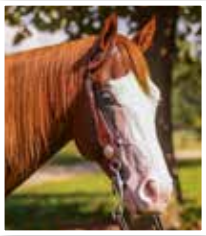
ROYCE Reining Donor: Cliff Reeder