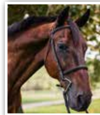
CORVICH Jumping Seat Donor: Vikki Hamill