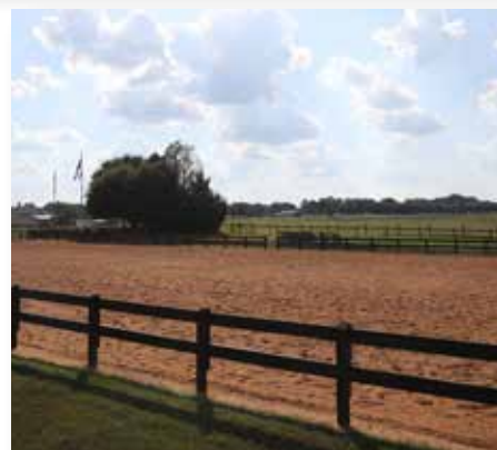
UNIVERSITY OF GEORGIA WESTERN ARENA

From Greenville via I-85 S: Take I-85 S toward Atlanta for 71.8 miles. Take the US-441/GA-15 exit, EXIT 149, toward Commerce/Homer/Banks Crossing. Turn left onto US-441 S/GA-15 S. Merge onto US-441 S/US-129 S/Paul Brown Pky/Athens Perimeter Hwy/GA-8 N/GA-15 S/GA-10-BL N via the ramp on the left toward Watkinsville. Merge onto US-441 S/US-129 S/US-29 S/GA-15 S/GA-10-BL S via EXIT 10C toward GA-10-LOOP INNER/Watkinsville/Lexington. Merge onto US-441 S/US-129 S via EXIT 4A toward Watkinsville/Madison. Turn left onto Astondale Rd. The UGA Equestrian Complex will be on the left.