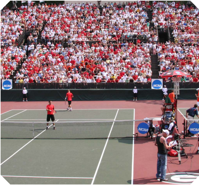
NCAA Tournament at the Dan Magill Tennis Complex, 2007