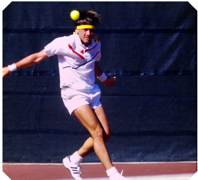
Mikael Pernfors, 1985