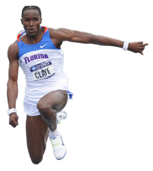
Will Claye, 2011 17.35m (56-11.25)