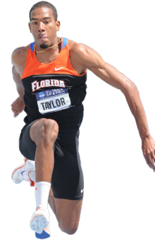
Christian Taylor, 2011 17.40m (57-1)