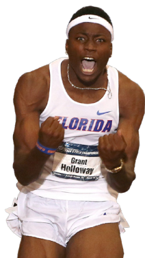
No. 1 Grant Holloway 7.35 - 2019 NCAA's