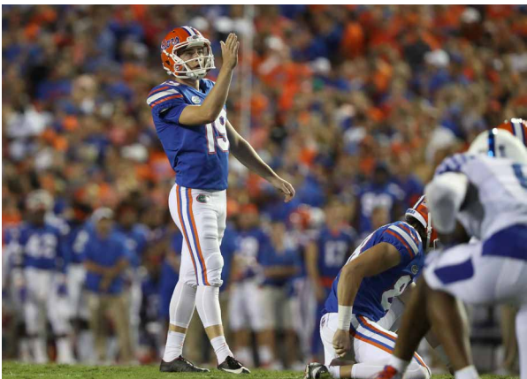
Florida missed numerous opportunities against Kentucky, but a controversial missed field goal--which snapped a streak of 20 consecutive makes for UF kickers--was a deflating moment for the Gators.