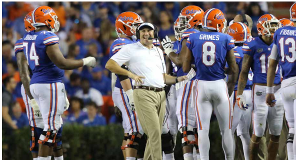
The Dan Mullen Era kicked off with a resounding victory over Charleston Southern, highlighted by an offensive explosion in the opening half.