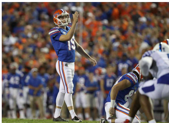
Florida missed numerous opportunities against Kentucky, but a controversial missed field goal--which snapped a streak of 20 consecutive makes for UF kickers--was a deflating moment for the Gators.