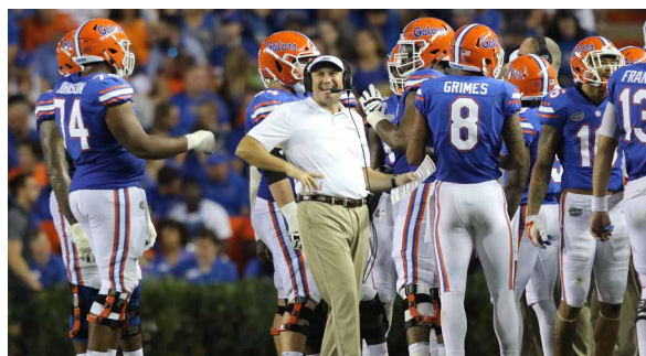
The Dan Mullen Era kicked off with a resounding victory over Charleston Southern, highlighted by an offensive explosion in the opening half.