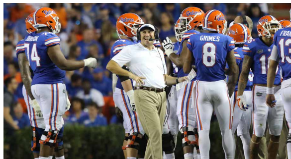
The Dan Mullen Era kicked off with a resounding victory over Charleston Southern, highlighted by an offensive explosion in the opening half.