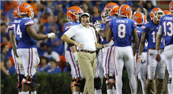
The Dan Mullen Era kicked off with a resounding victory over Charleston Southern, highlighted by an offensive explosion in the opening half.