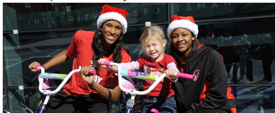
Georgia players pose with a young Lady Bulldog fan during the team's annual Bike Build.