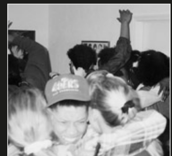
The 1993 Lady Gators became the first UF team to earn a trip to the NCAA Championship.