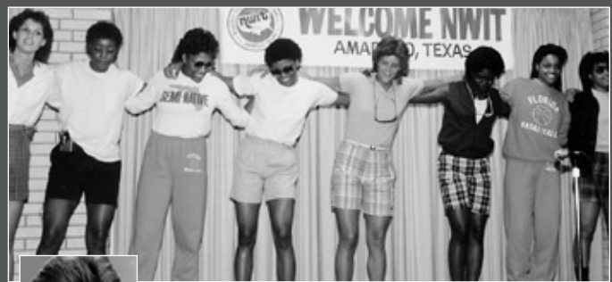
The '85 Lady Gator team reached the finals of the NWIT.