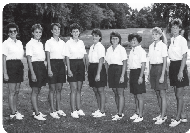
The 1987 team successfully defended its SEC Championship Title with a two-stroke victory to earn back-to-back conference titles.