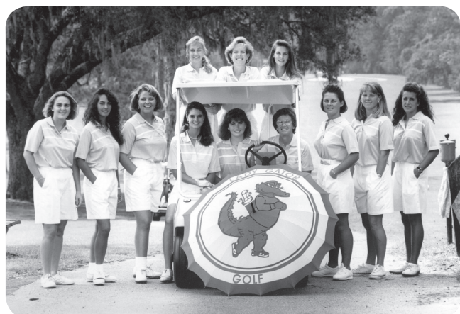
The 1991 team claimed the program's fourth SEC Title, as the Lady Gators outplayed the field by six strokes.