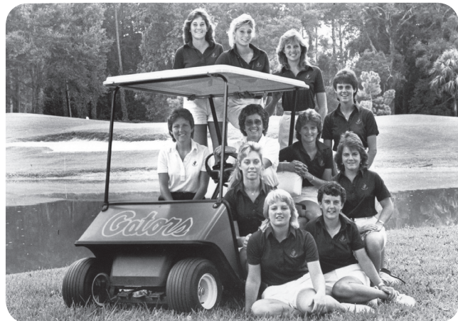
The 1984 Lady Gators claimed the program's third SEC Title with a six-stroke victory.

From 1981 to 1987, Lady Gator golfers claimed five of seven SEC Titles. Also during that reign, the 1983 and 1985 teams each came in second at the conference tournament. In addition, Lady Gator golf teams brought home first-place hardware from two NCAA National Championships during the six-year span.