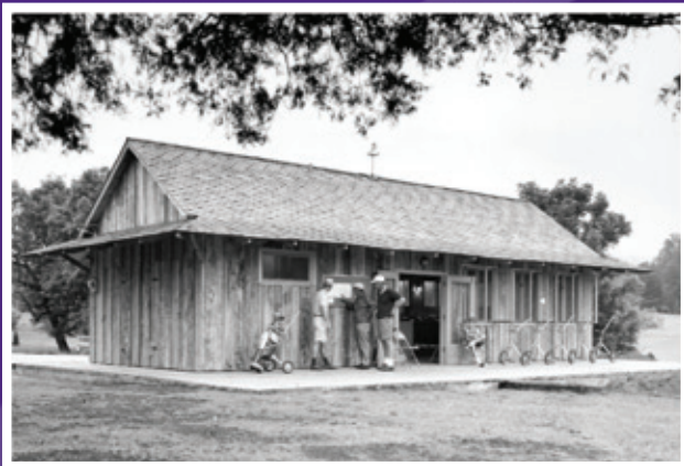
Built in the late 1960's as shown above, the Furman Pro Shop has been expanded twice to include offices and locker rooms.