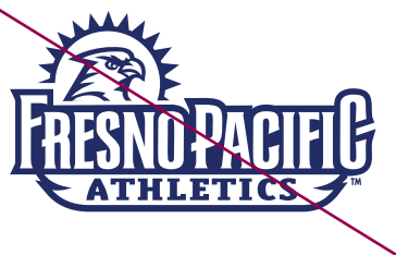
Do not move or change the scale of the signature's elements.