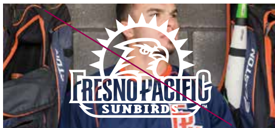
Do not use the signature over a busy pattern or image.