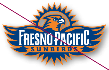
Do not use a drop shadow or other effects with the signature.