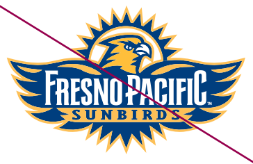
Do not use unapproved colors for the signature.