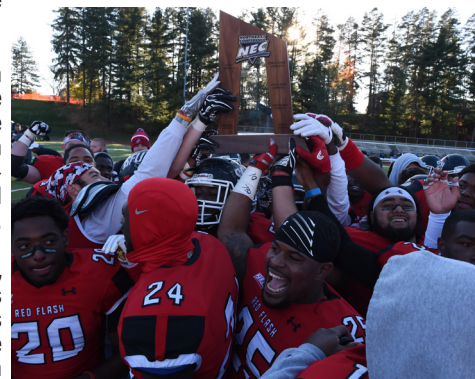
The two NEC Championship teams (2016 [pictured] and 2023) both started the NEC slate with a victory in the NEC opener on the road.