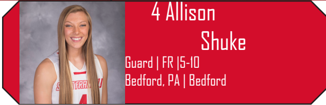
4 Allison Shuke