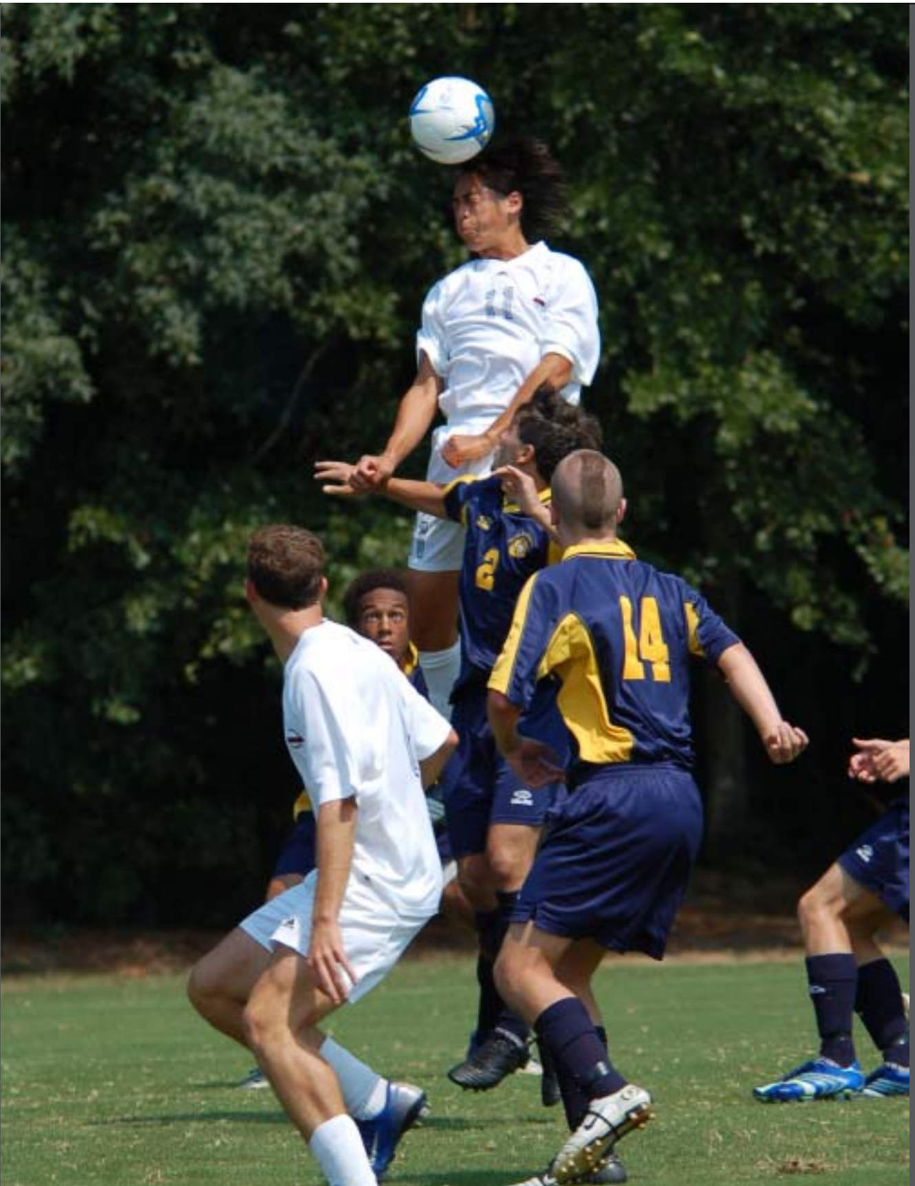
Francis Marion University 2008 Men's Soccer