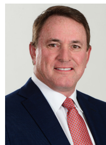
Butch Davis FIU Head Football Coach