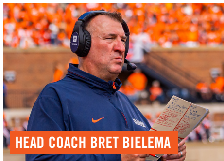
HEAD COACH BRET BIELEMA

Rankings are AP Top 25 from Aug.-Oct. / CFP Rankings in Nov.