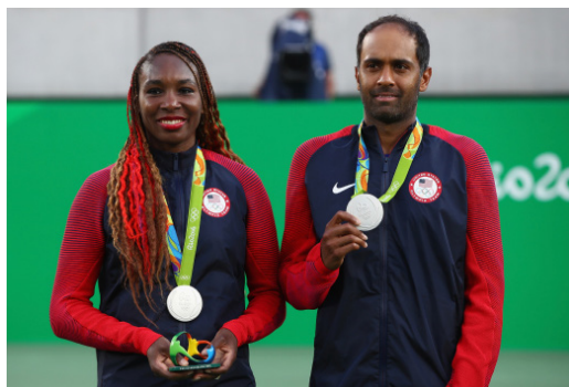
2016 RIO OLYMPICS RAJEEV RAM SILVER - MIXED DOUBLES