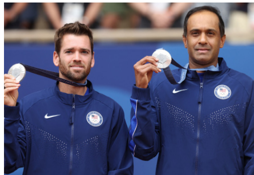
2024 PARIS OLYMPICS RAJEEV RAM SILVER - MEN'S DOUBLES