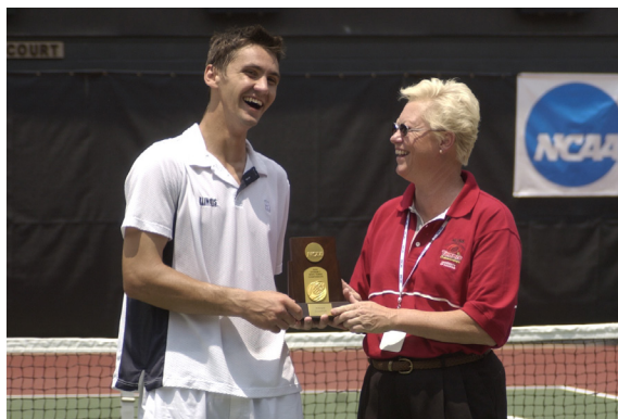
2003 AMER DELIC