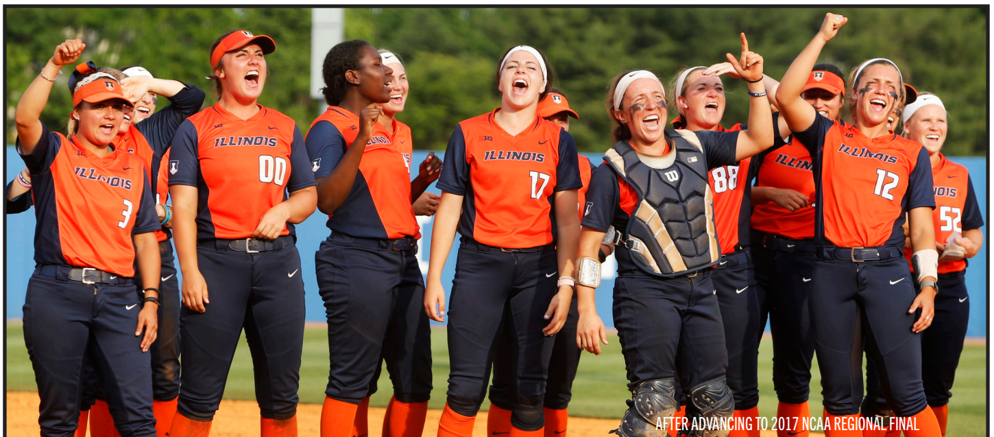
AFTER ADVANCING TO 2017 NCAA REGIONAL FINAL