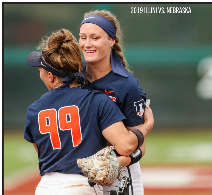
2019 ILLINI VS. NEBRASKA