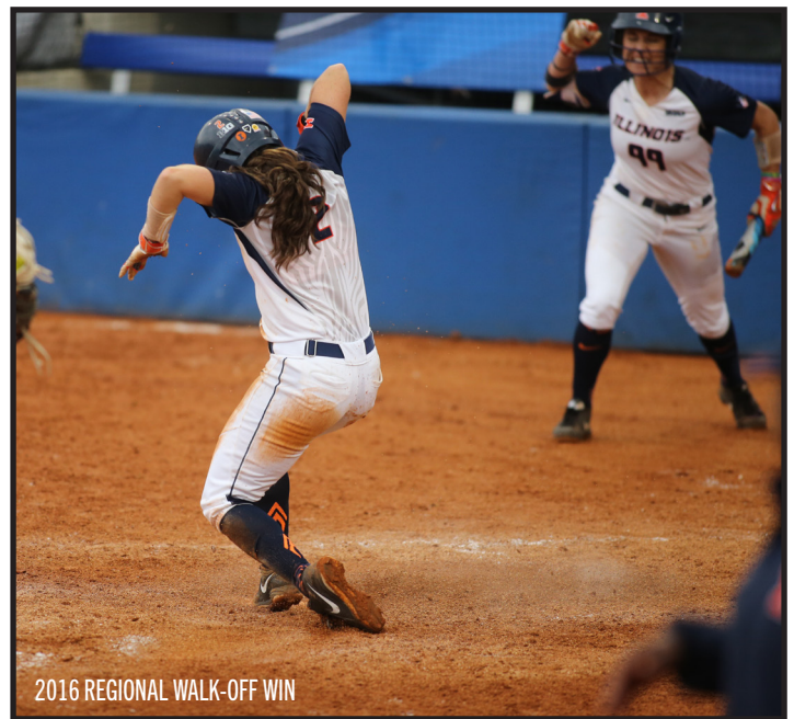
2016 REGIONAL WALK-OFF WIN

May 20 Arizona 8, Illinois 3 May 21 Illinois 0, Missouri State 2