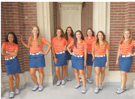
The 2013-14 Fighting Illini