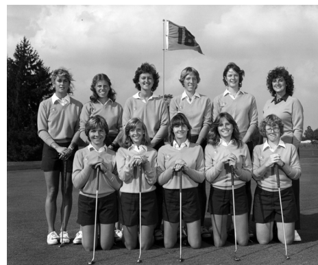
The 1982-83 Fighting Illini