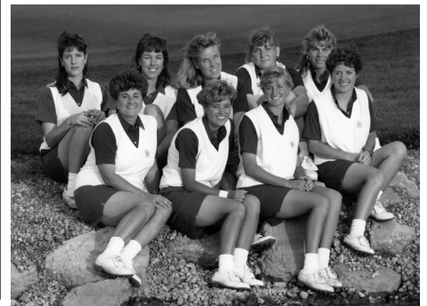
The 1989-90 Fighting Illini