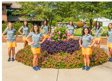
The 2015-16 Fighting Illini