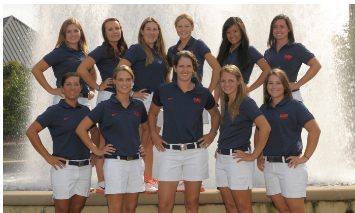
The 2011-12 Fighting Illini twice shattered the 54-hole tournament school record and set the program's all-time top score of 853 (-11) at the Westbrook Spring Invitational.