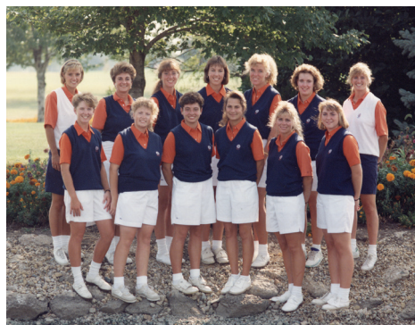
The 1990-91 Fighting Illini