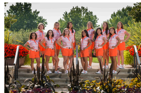
The 2014-15 Fighting Illini