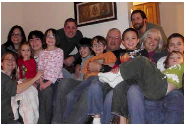
THE COLBY FAMILY ▶