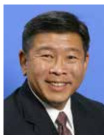
Gene Honda Memorial Stadium Public Address Announcer