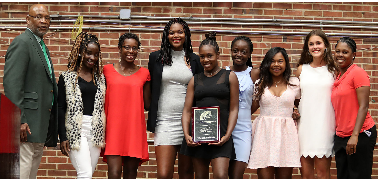
The Lady Rattler Tennis Team shows off the award they received at the FAMU Athletics Recognition Ceremony for having the highest cumulative GPA of all of FAMU's teams.