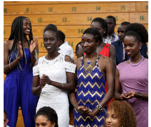
Members of the six-time defending MEAC Cross Country Championship Team