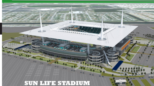
SUN LIFE STADIUM