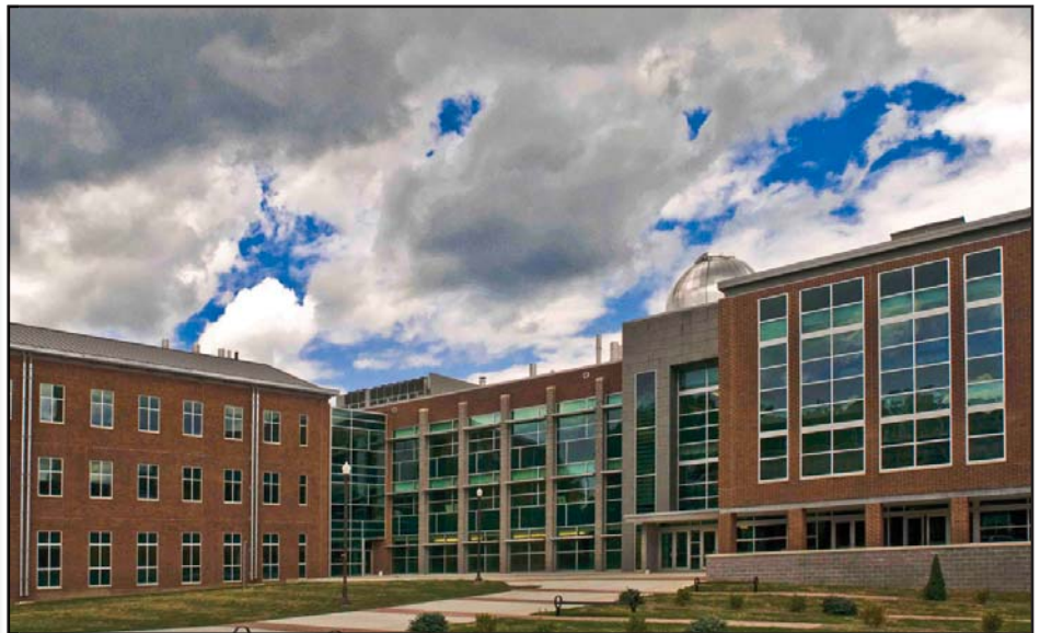
The Science and Technology Center, a $40 million state-of-the-art facility, will be open for the Fall 2008 semester.

Field Hockey Office, First Floor, Koehler Fieldhouse — Take right at the first light on East Brown Street. Go up the hill 6/10th of a mile, take the first left onto Smith Street. The fieldhouse is on the left on the corner of Smith and Normal streets.