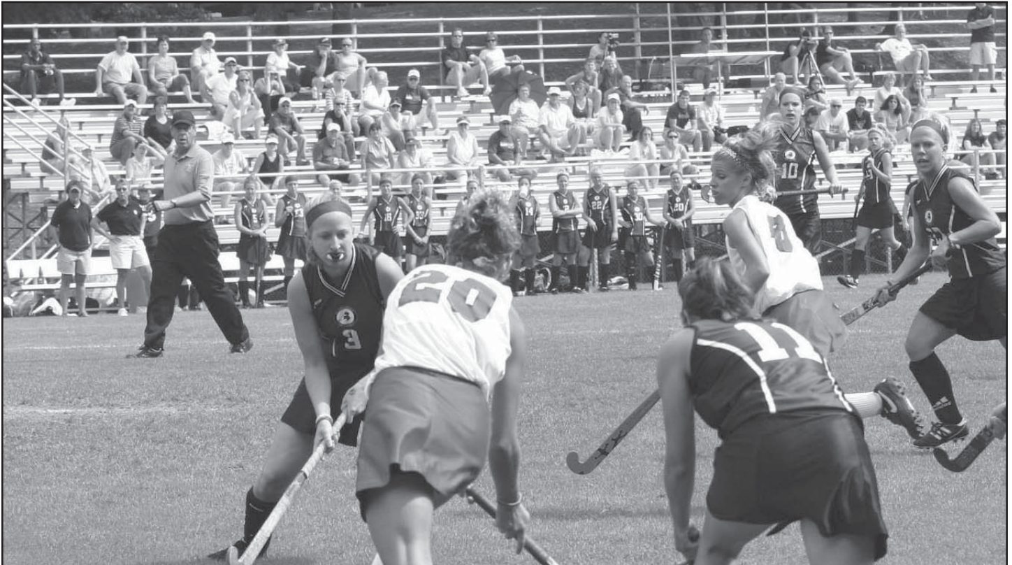
Whitenight Field is located on the north end of campus, below ESU's University Apartments.