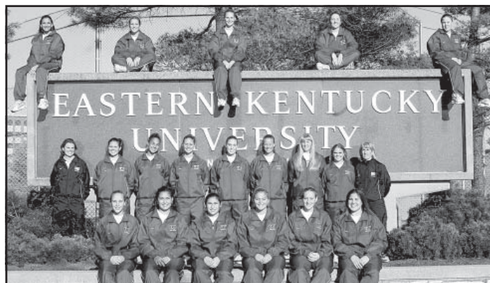
Eastern's 2002 squad was the first to capture an Ohio Valley Conference title.