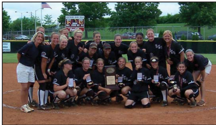
The 2004 ECU team advanced to the NCAA tournament and owns the program record for most wins in a season (42).