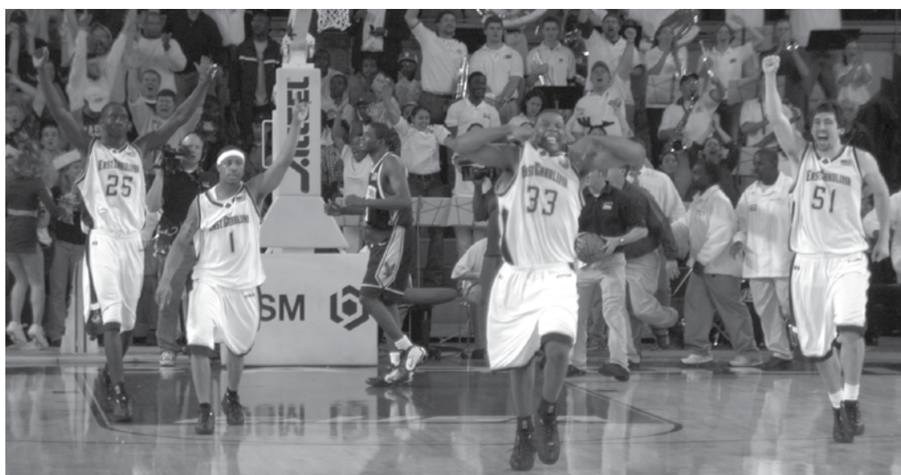
ECU handed Marquette consecutive losses as ranked team at Minges Coliseum in 2003.