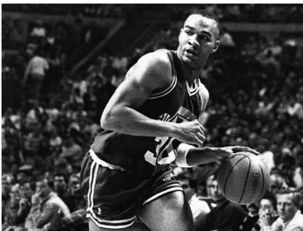
Blue Edwards (left) played 10 seasons for five different NBA franchises.