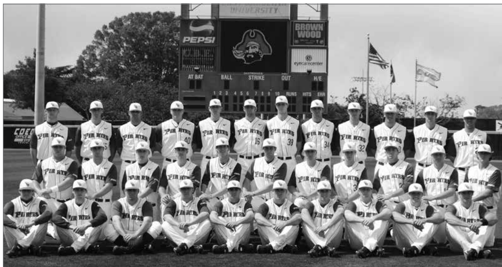
2009 C-USA Regular Season and NCAA Greenville Regional Champs