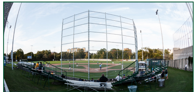
Kinsmen Civic Memorial Stadium