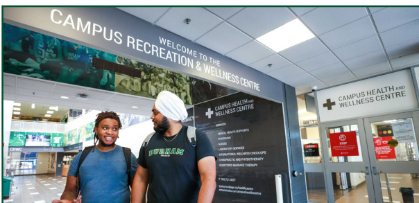
Health and Wellness Centre