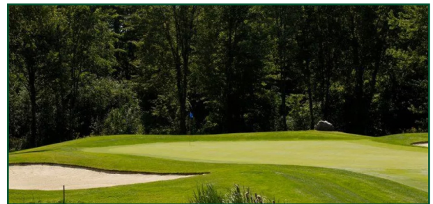
Watson's Glen Golf Club