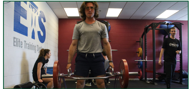
Varsity Training Centre