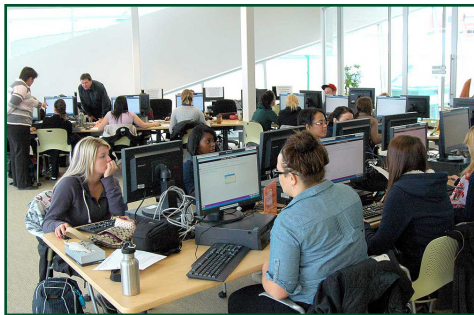
Additional Study Space

As the level of competition increases, coaches play a more important role in helping athletes perform at their maximum potential. When it comes to education, there are coaches off the field who can help students achieve their academic best.