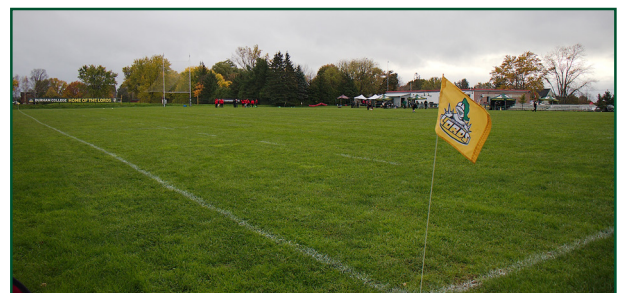
Thompson Rugby Park