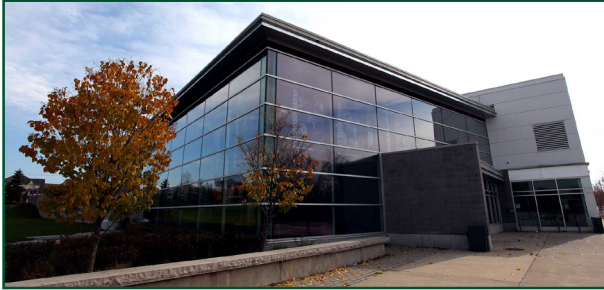
Campus Ice Centre