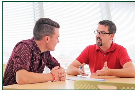
Academic Support Services