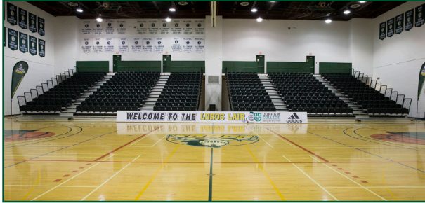
Campus Recreation & Wellness Centre