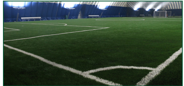
Campus Fieldhouse (CFH)