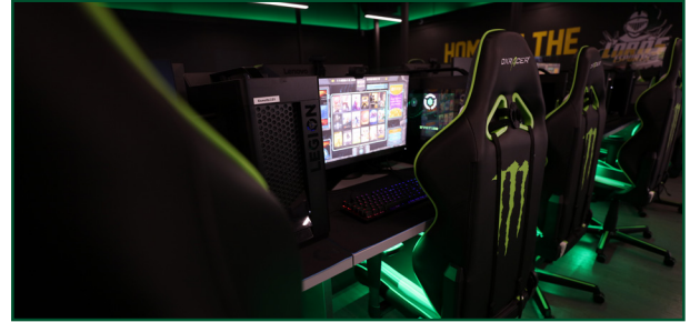
ESports Gaming Arena