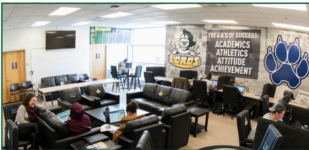
Varsity Academic Study Lounge