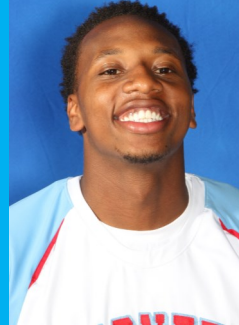
44 AMERE MAY GUARD - SR 6-3/185 COVERT, MICH.