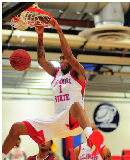
first four weeks and each of the last three weeks.

Gray is tops in the MEAC in six statistical categories, ranking in the top 14 among all Div. I players in each. He is second in the nation in total rebounds (243), sixth in double-doubles (12), 10th in blocks per game (3.0) and 14th in total blocks (57).