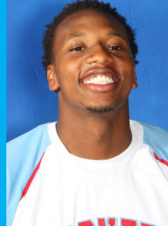
44 AMERE MAY GUARD - SR 6-3/185 COVERT, MICH.