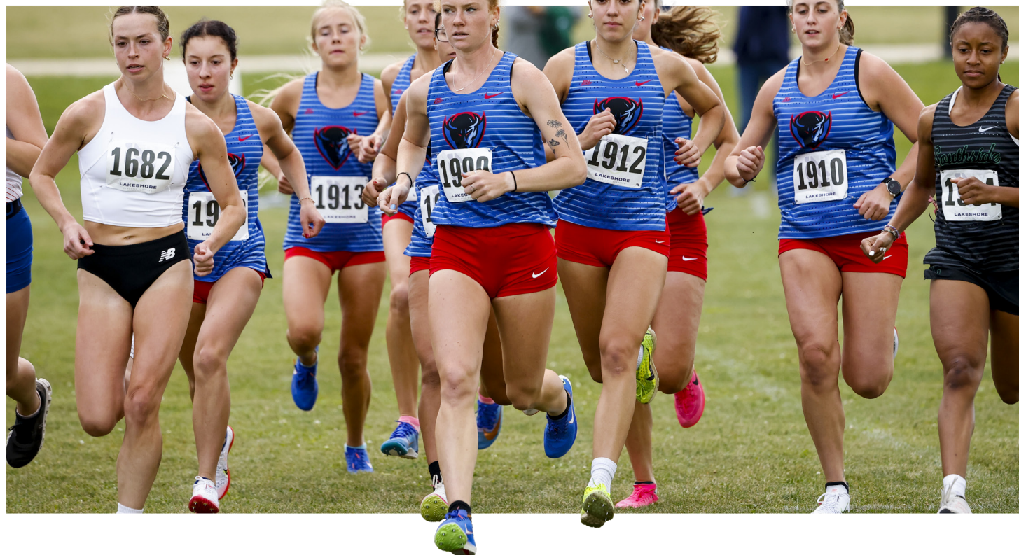
Women's Cross Country compete in the Huskie Opener, finishing first. September 6, 2024

DePaul Cross Country continued its upward trajectory in 2024, building on the momentum of the past few years. Veterans provided reliable leadership while several underclassmen emerged as top-five scorers, helping both squads take a step forward.