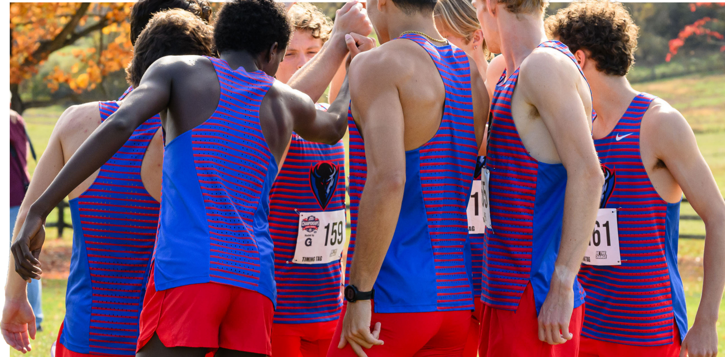
November 1, 2024 Men's Cross Country huddles before competing in the BIG EAST Championships, finishing seventh.