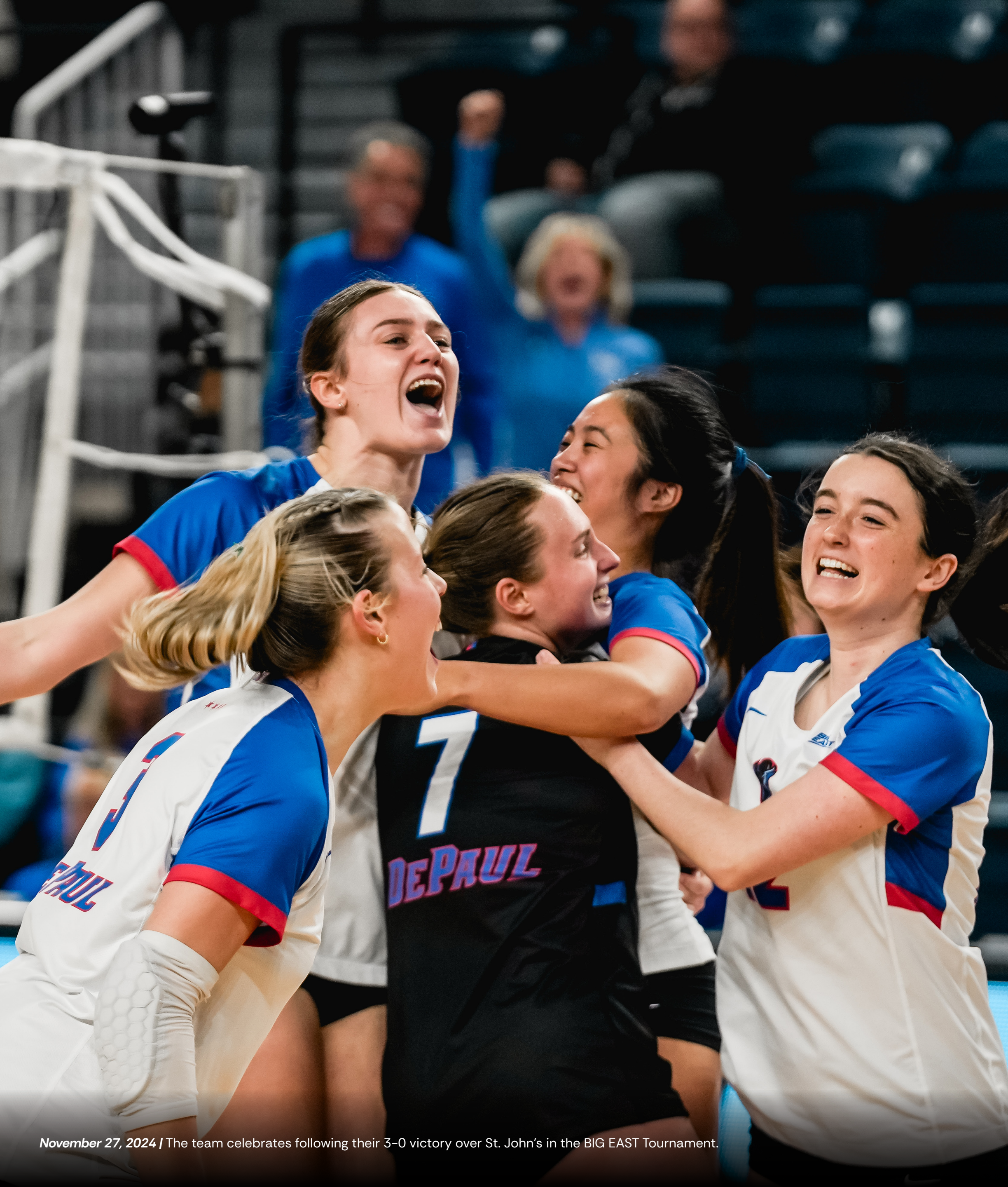
November 27, 2024 | The team celebrates following their 3-0 victory over St. John's in the BIG EAST Tournament.