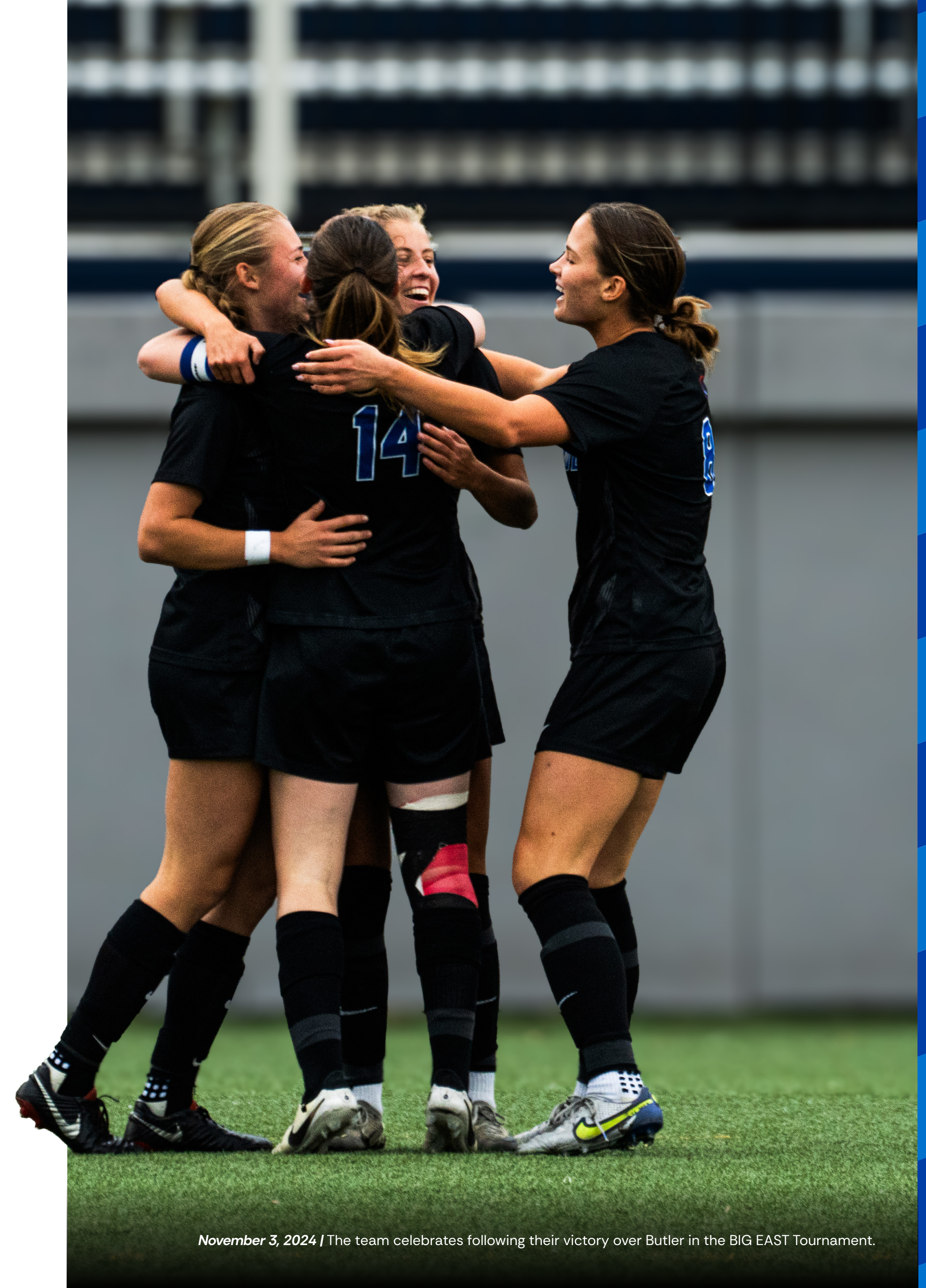
November 3, 2024 / The team celebrates following their victory over Butler in the BIG EAST Tournament.