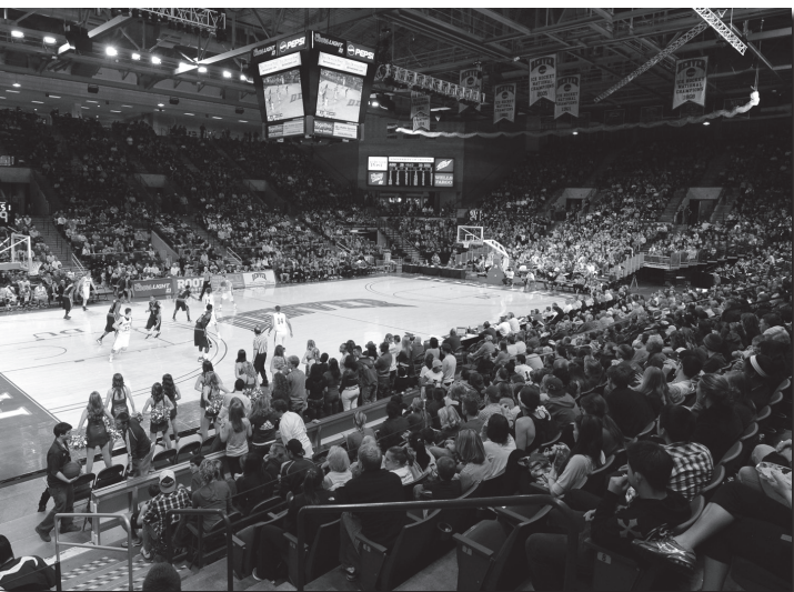
Magness Arena - Denver vs. Arkansas State 1/26/2012

7,186 .....Jan. 2, 2006 vs. Wyoming, W 69-64 7,168 .....Dec. 19, 2011 vs. Wyoming, W 57-46 7,075 .....Jan. 26, 2012 vs. Arkansas State, W 66-52 6,535 ..... Dec. 13, 2004 vs Stanford, L 52-56 6,420 ..... Nov. 11, 2011 vs. Portland State, W 69-61 6,406 ..... Feb. 22, 2014 vs. Omaha, W 72-60 6,355 ..... Dec. 22, 2011 vs. The Citadel, W 70-58 6,319 .....Jan. 6, 2004 vs. Wyoming, W 63-62