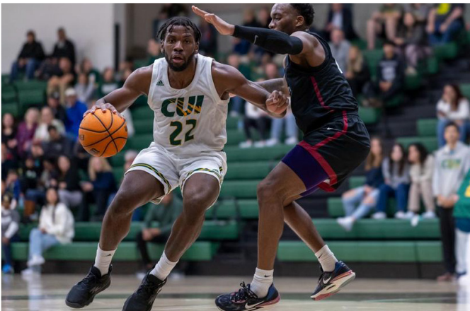
Tim Adetukasi (2023-2024)