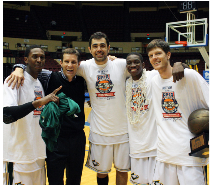
2011-2012 National Champions