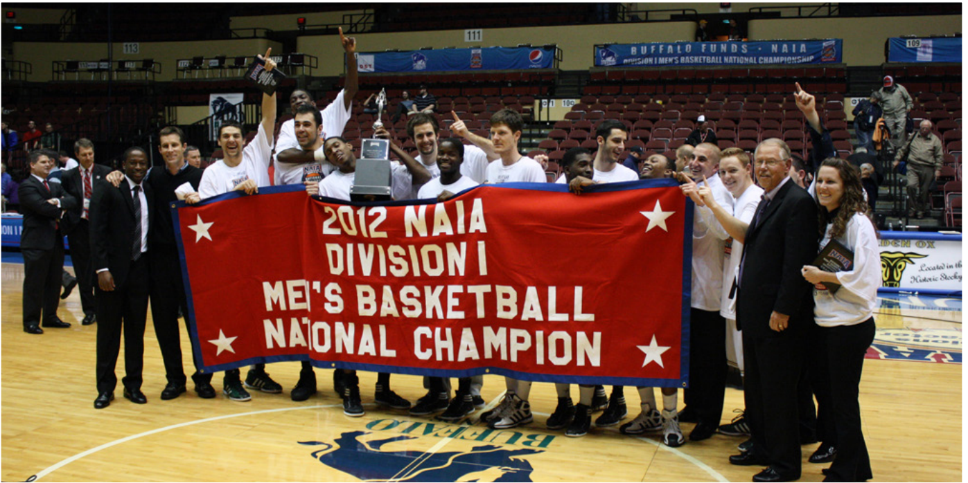
2012 NAIA National Champions