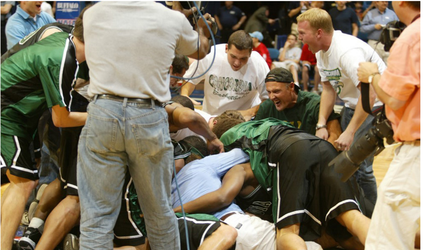
2003 NAIA National Champions