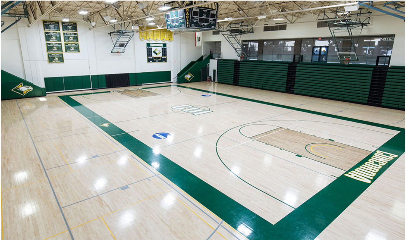
CU Arena hardwood court from 2017-2023