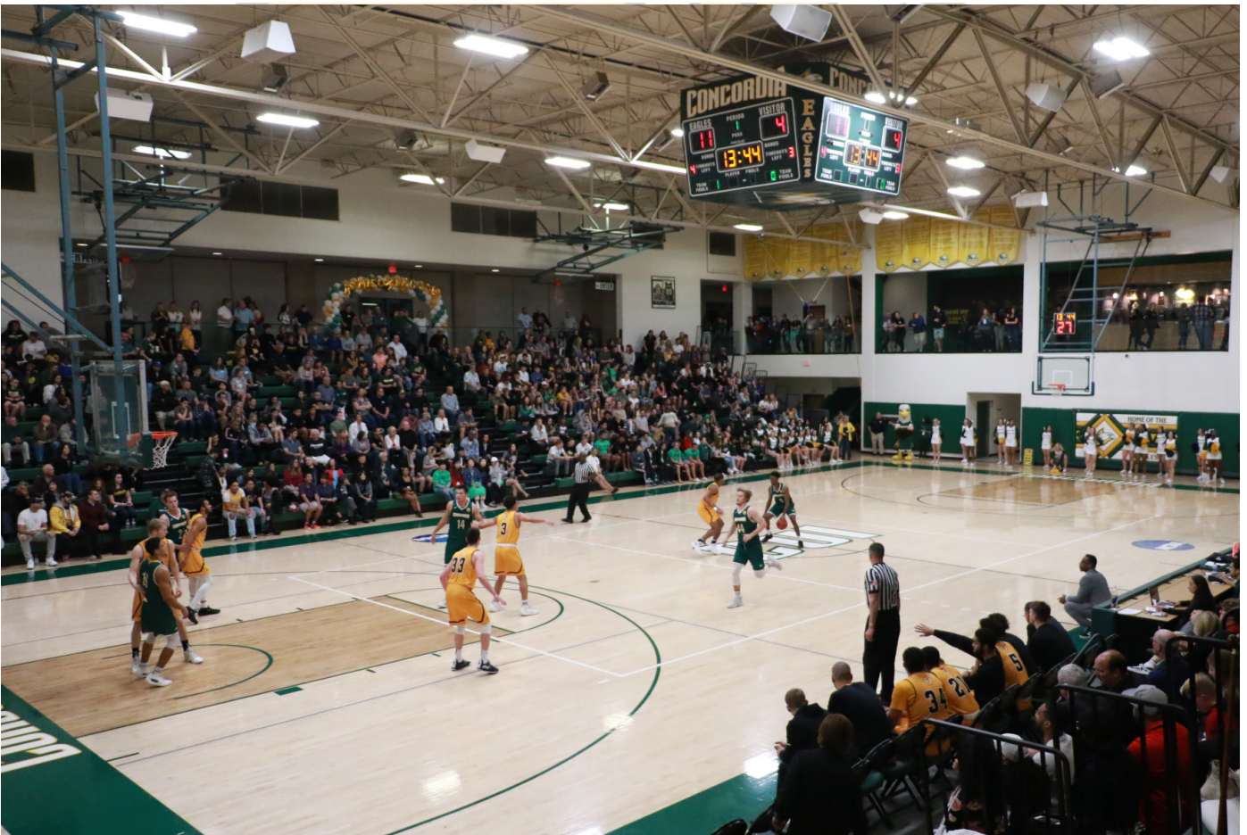
2019 Home Game vs Dominican