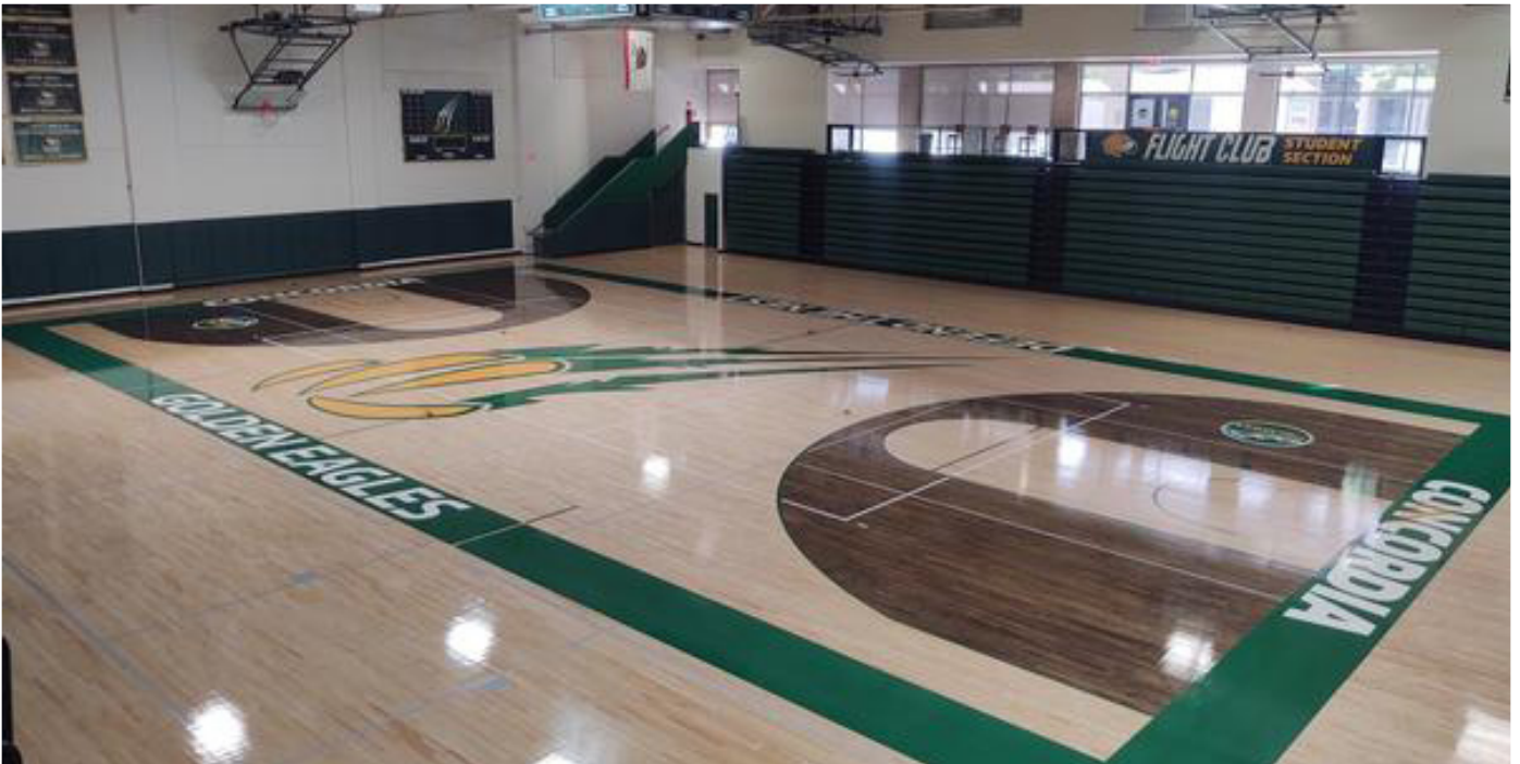
CU Arena hardwood court from 2023-present