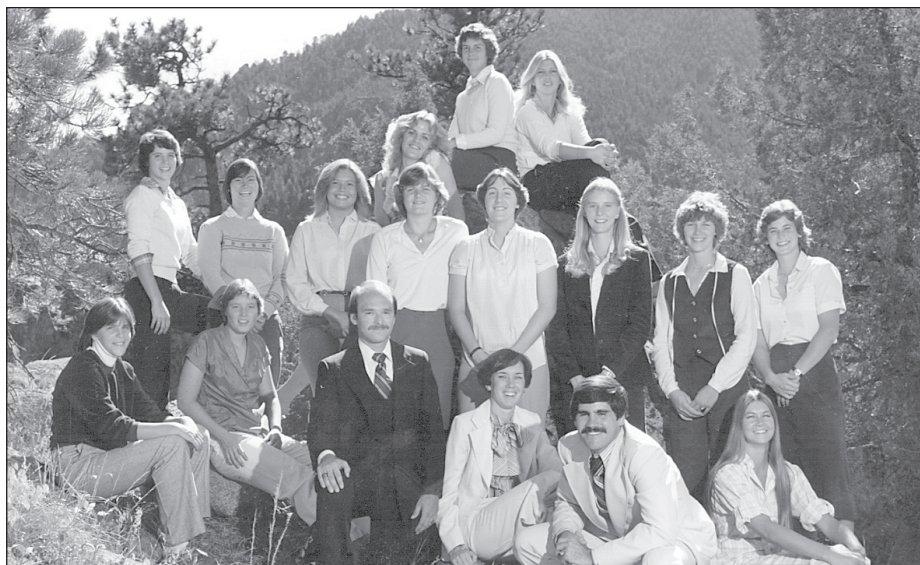
RENE PORTLAND'S 1979-80 TEAM WAS COLORADO'S FIRST TO BE NATIONALLY RANKED.

March 13, 1995—Colorado is voted the second-ranked team in the country in the final Associated Press poll of the 1994-95 season. It is the highest ranking in the program's and Big