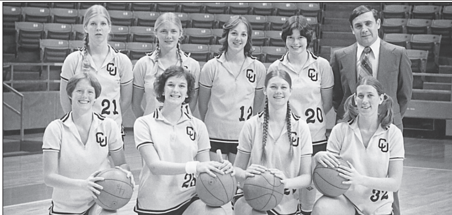
COLORADO'S 1977-78 TEAM WAS ITS WINNINGEST TO DATE, WITH AN 18-14 MARK.