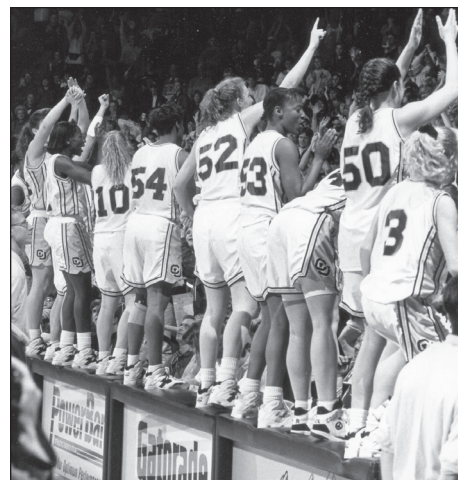
CU CELEBRATES ANOTHER NCAA TOURNAMENT WIN.