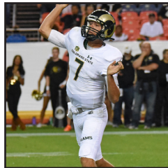
WHITE / WHITE (4-3)

2015 at UTSA - W, 33-31 at Wyoming - W, 26-7 at New Mexico - W, 28-21 at Fresno State - W, 34-31 vs. Nevada - L, 28-23 2016 vs. Colorado - L, 44-7 2017 at Wyoming - L, 16-13