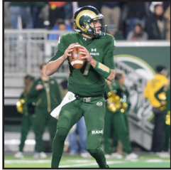
GREEN / GREEN (2-1)

2015 Minnesota - L, 23-20 (OT) vs. Colorado - L, 27-24 (OT) Boise State - L, 41-10 Air Force - W, 38-23 San Diego State - L, 41-17 2016 UTSA - W, 23-14 2017 vs. Oregon State - W, 58-27 vs. San José State - W, 42-14