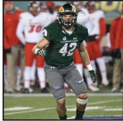
GREEN / GREY (1-0)

2015 at Utah State - L, 33-18 2016 Fresno State - W, 37-0 vs. Idaho - L, 61-50 2017 Air Force - L, 45-28