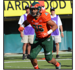
ORANGE / GREEN (1-0)

2015 Savannah State - W, 65-13 2017 Abilene Christian - W, 38-10