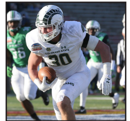
WHITE / WHITE (WHITE HELMET) (0-1)

2016 at UNLV - W, 42-23 at Air Force - L, 49-46 2017 at Alabama - L, 41-23 at New Mexico - W, 27-24