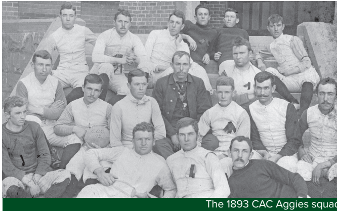
The 1893 CAC Aggies squad