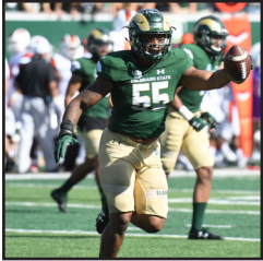
GREEN / GOLD (4-4)

2015 Minnesota - L, 23-20 (OT) vs. Colorado - L, 27-24 (OT) Boise State - L, 41-10 Air Force - W, 38-23 San Diego State - L, 41-17 2016 UTSA - W, 23-14 2017 vs. Oregon State - W, 58-27 vs. San José State - W, 42-14