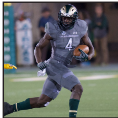
GREY / GREY (0-1)