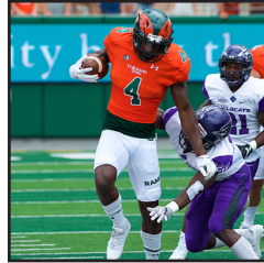
ORANGE / WHITE (2-0)

2015 Savannah State - W, 65-13 2017 Abilene Christian - W, 38-10