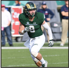
GREEN / WHITE (2-2)

2016 Utah State - W, 31-24 at Boise State - L, 28-23 2017 vs. Nevada - W, 44-42