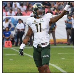
WHITE / GREEN (3-2)

2015 at UTSA - W, 33-31 at Wyoming - W, 26-7 at New Mexico - W, 28-21 at Fresno State - W, 34-31 vs. Nevada - L, 28-23 2016 vs. Colorado - L, 44-7 2017 at Wyoming - L, 16-13