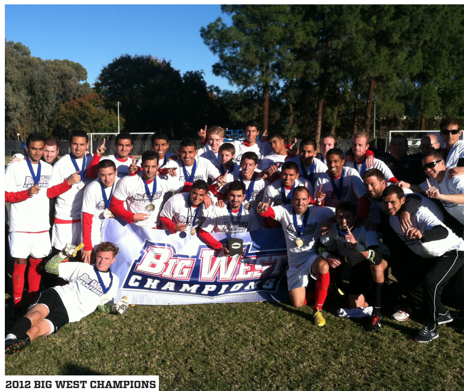
2012 BIG WEST CHAMPIONS