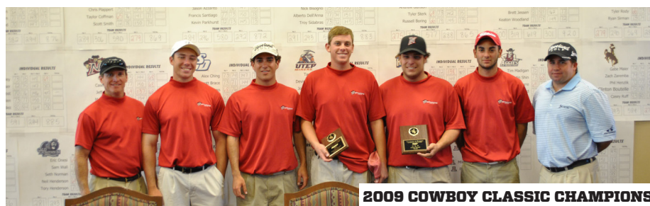
2009 COWBOY CLASSIC CHAMPIONS