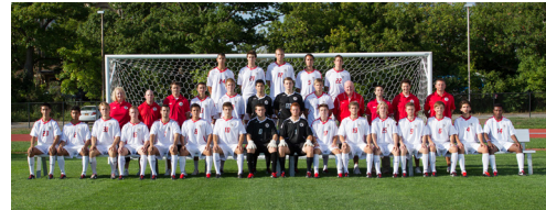
Team photo of the 2012 Cornell men's soccer team, the last team to have appeared in the NCAA Tournament