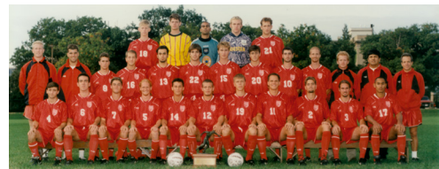
Team photo of the 1996 Cornell men's soccer team