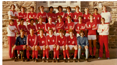
Team photo of the 1980 Cornell men's soccer team