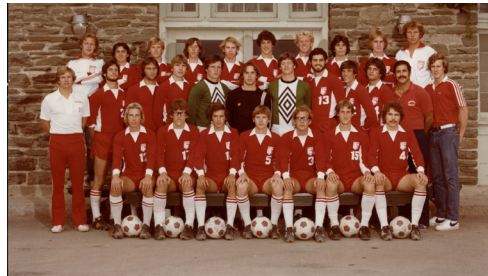
Team photo of the 1977 Cornell men's soccer team, the last squad to win an NCAA Tournament game