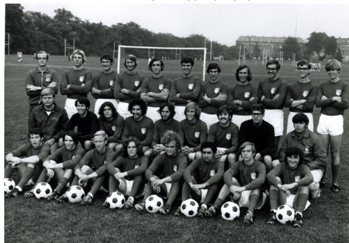
Team photo of the 1971 Cornell men's soccer team, the first Big Red team to advance to the NCAA Tournament