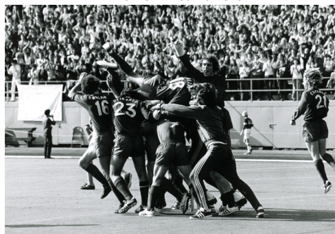
Members of the 1975 Cornell men's soccer team celebrate a goal during the season