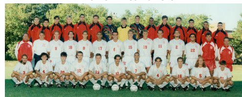
Team photo of the 1995 Cornell men's soccer team