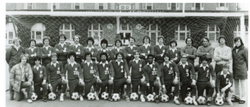
Team photo of the 1976 Cornell men's soccer team