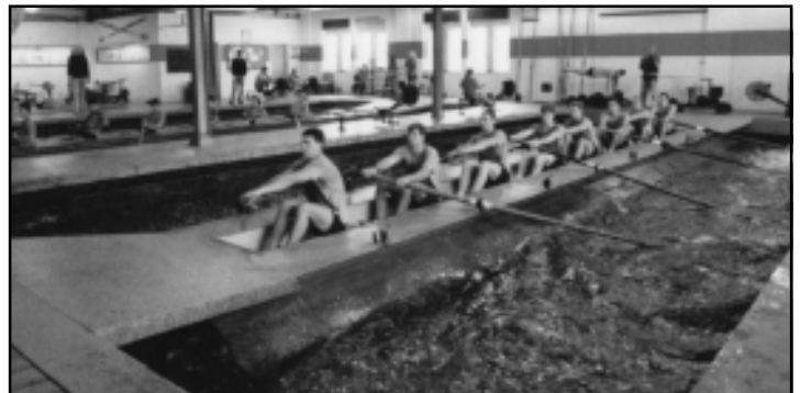
TEAGLE HALL INDOOR ROWING TANKS