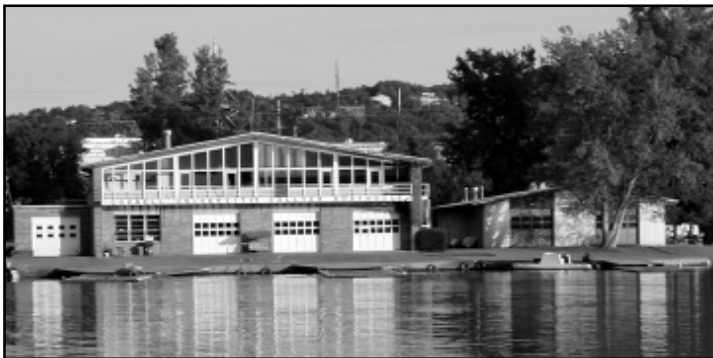
COLLYER AND ROBISON BOAT HOUSES