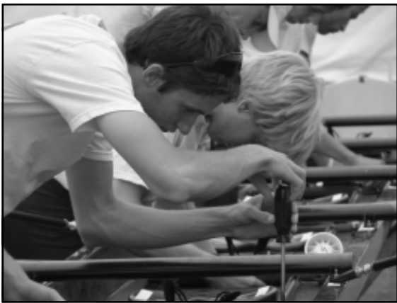
Above: Members of the Big Red lightweight crew rig the boat prior to its first practice run at Henley.