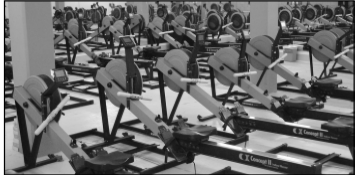
TREGURTHA ERG ROOM