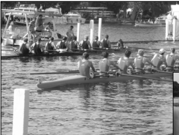
Right: The Big Red gets off to an early lead in a win over Pembroke and Christ Church of Oxford as the crowd cheers on the banks of the River Thames.