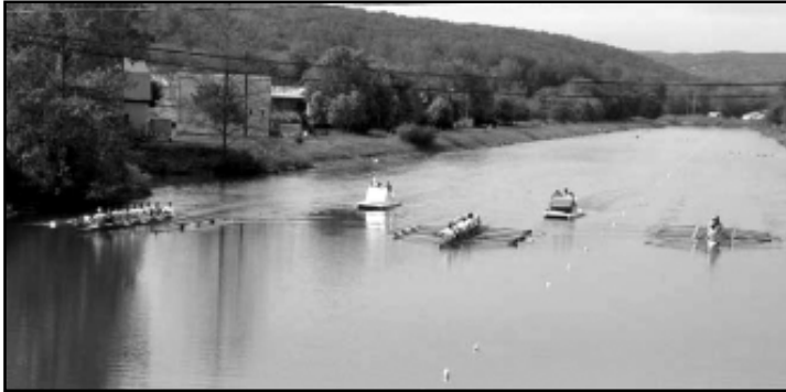
RACE DAY ON CAYUGA INLET

For most athletes who row, their favorite place on campus is in a boat, on the water. At the same time, members of the crews enjoy multiple venues for training. The space allocated to these athletes speaks of the University's support of rowing and the long history the sport has at Cornell. On central campus, Teagle Hall is home base for the men's and women's crews. Two moving water rowing tanks, training space for ergometer work and circuits plus an office suite for the coaching staff are contained within the Charles J. Abbe '63 Training Facility. Just around the corner in Teagle is the Tregurtha Erg Room where more floor space is devoted to all "slider" ergometers. Up the hill past Lynah Rink, athletes work with certified assistant coaches in the Friedman Strength & Conditioning Center. Down the hill, approximately two miles from campus, are the Collyer Boathouse and the Doris Robison Shell House.