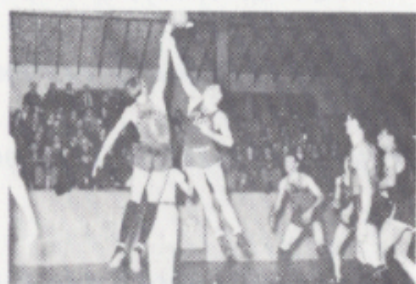
Campbell & O'Connell jump.