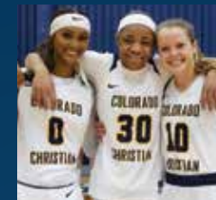
Colorado Christian Athletics