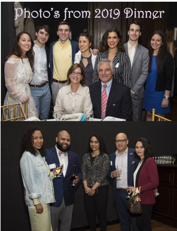
Photo's from 2019 Dinner

Best wishes to All Our Hall of Fame Fencers and All Our Honorees!