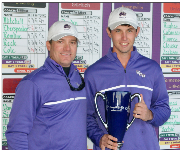
2013 Hummingbird Intercollegiate individual medalist – and WCU's home tournament namesake – current PGA Tour player, former Catamount men's golfer J.T. Poston.

single marker in 2014 with UCF rallying past Vanderbilt in 2008 for a one-stroke victory, using a tournament-record 36-hole score of 557.