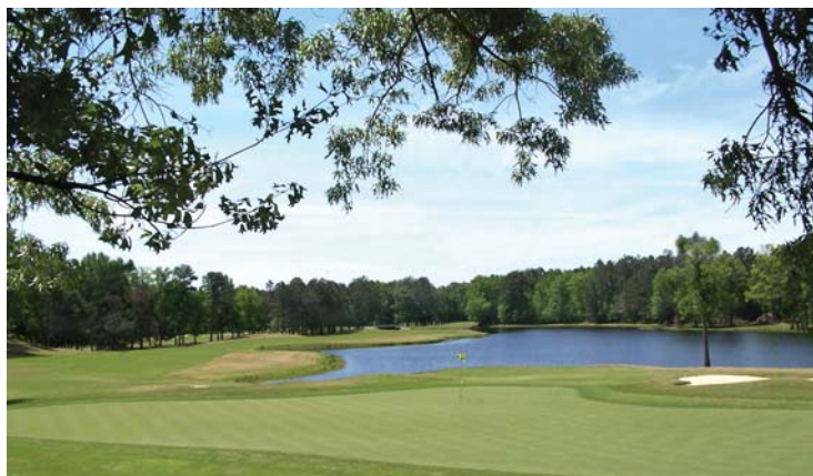
Keith Hills Country Club is the home course of the Fighting Camel teams.