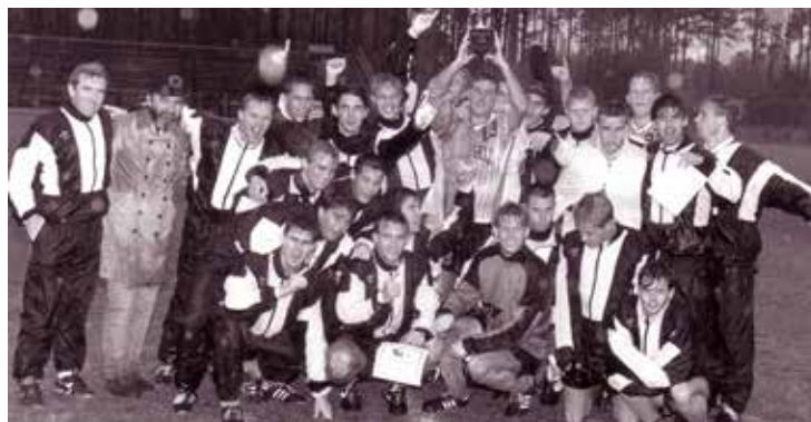
The Camels lifted the program's third Big South Conference tournament championship trophy in 1991.