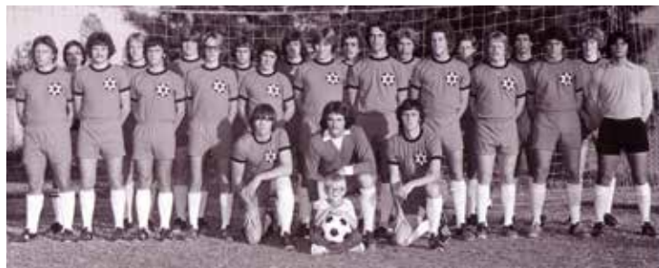
The 1973 team accounted for a school-record 17 goals in a victory over North Carolina Wesleyan.

@ at Dunn, N.C. % NAIA Area 5 Championship (Buies Creek, N.C.) & NAIA National Tournament (Dunn, N.C.)