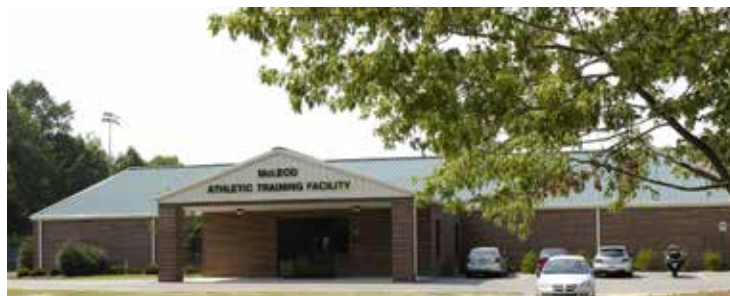
Newly renovated dressing rooms are located in the McLeod Athletic Training Facility, located just beyond the east goal

In addition to the 2008 and '09 A-Sun men's championship, CU also hosted the 2000 Atlantic Sun Conference men's soccer tournament at the facility. The 1995, 2002 and 2004 A-Sun Women's Soccer tournaments were also held at the