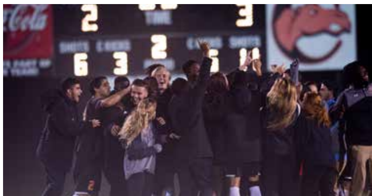
Camels fans celebrating the 2015 Big South Championship quarterfinal victory

Seating for 1,000 spectators is situated on an 18-foot earthen ridge across the Bermuda grass pitch from the team benches and pressbox. The field measures 75x120 yards.