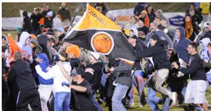
Camels fans have celebrated some of the top moments in CU Soccer history at the Eakes Complex.

Campbell's men notched an 8-1-0 record at home in 2006, when the Camels again led the Atlantic Sun with an average attendance of 639. CU twice set Eakes Complex attendance records in a 1-0 victory over third-ranked North Carolina (1481) and a 4-0 triumph over Lipscomb on Homecoming