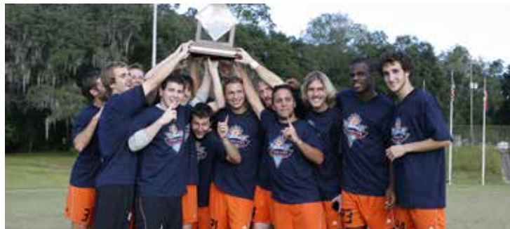
In 2007, Campbell claimed its first Atlantic Sun tournament title and berth in the NCAA College Cup.