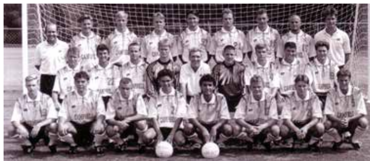
Campbell won the 1993 Big South Conference regular season championship while compiling an overall 16-4-0 record.