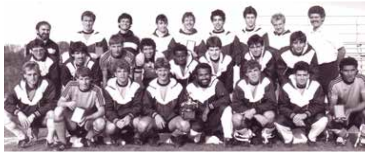
Campbell claimed the inaugural Big South Conference title in 1984.