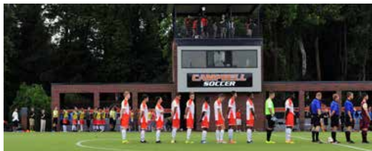
Pregame ceremonies before the first men's match played in front of the new benches and pressbox

Lights were added at the Stadium prior to the 1994 season to allow for play after dark. A new scoreboard was erected at the southwest end of the field prior to the 2002 campaign. A new Campbell Soccer windscreen, complete with logos and