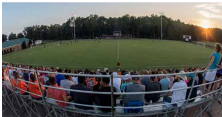
Fans enjoying the opening match of the 2016 season