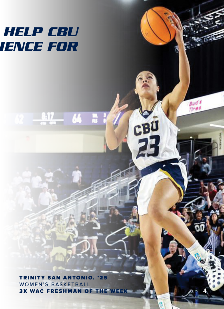
TRINITY SAN ANTONIO, '25 WOMEN'S BASKETBALL 3X WAC FRESHMAN OF THE WEEK