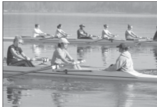
The squad practices in Miami, Fla., on a winter training trip.

Admissions Phone: (570) 577-1101 Application Deadline: Regular Decision — January 1, 2005; Early Decision I — November 15, 2004; Early Decision II — January 1, 2005; Financial Aid — Nov. 15 (ED)/Jan. 1 (Reg)